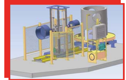
Basic Machine with One Turntable and Two Spindles