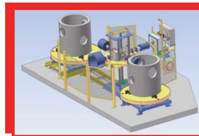
Basic Machine with Dual Turntables and Four Spindles