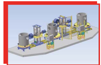
48" Turntable, 2-Spindle Machine, Standard Turntable, 4-Spindle Machine, Traversing Turntable

As the exclusive distributor of Marion Engineering and Technology Core-Matic® Coring Machines, Press-Seal Gasket is excited to present the Next Generation of Core-Matic's® that are Smarter, Faster, Safer creating "The New Standard in Productivity". Our next generation of Core-Matic's® is based on an in-line modular bi-directional design. This allows you to customize a machine for your specific needs today while economically expand tomorrow and beyond as your company and coring requirements grow and change.